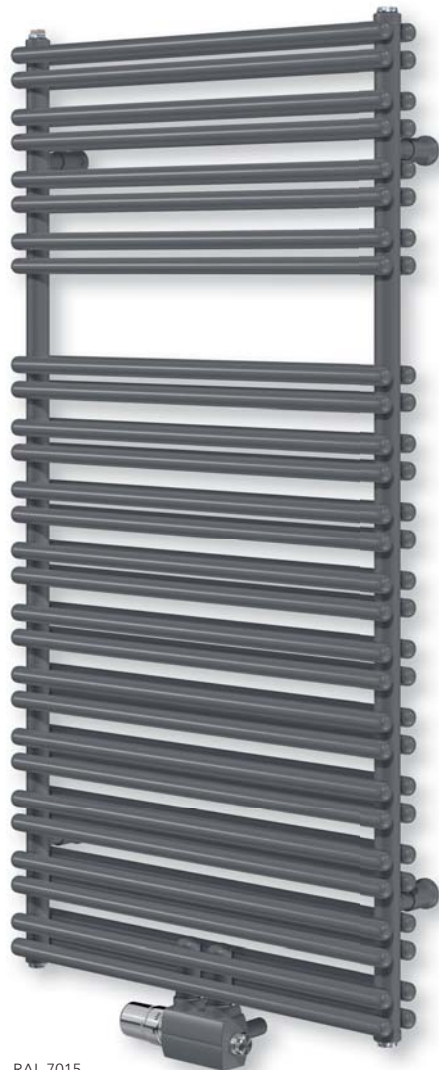
RAL 7015 slate grey