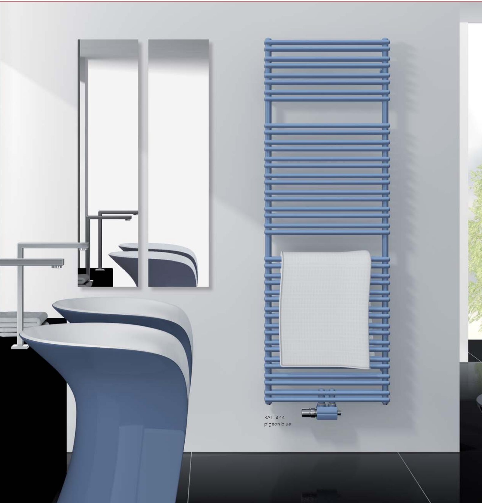
RAL 5014 pigeon blue

HIDRA CERAMICA & MASTELLA DESIGN furniture