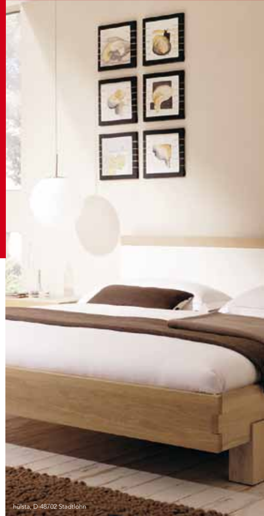
hülsta, D 48702 Stadllohn