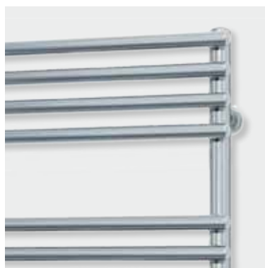
Della-E in chrome design.