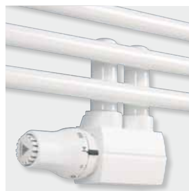
Dion with central valve connection and covering rosette.