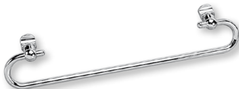
Bath towel holder