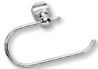
Hand towel ring