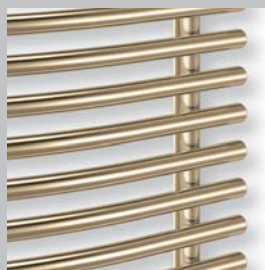
Model in gold