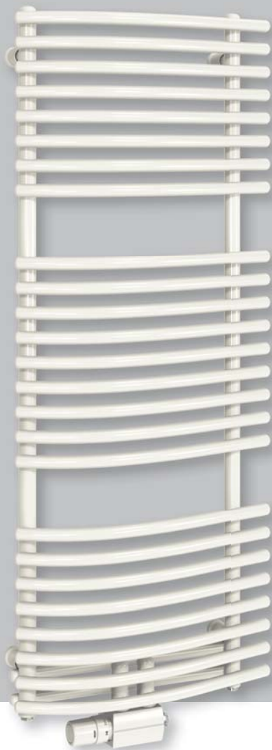
RAL 9016 traffic white