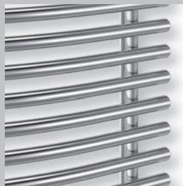
Model in chrome